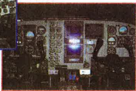
Piper PA31 Cheyenne II

With custom designed and handcrafted instrument panels our specialty, Columbia's customers enjoy the latest avionics and in-flight entertainment systems, knowing that the equipment is installed properly and in a manner that meets or exceeds FAA safety standards.